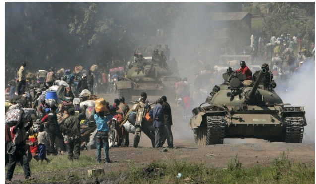
Uncertainty in fragile states can have devastating impacts on agricultural systems and on-farm livelihood sources

These include a context analysis tool, intervention prioritization framework and seed sector road map and development plan. The tools will be developed in collaboration with seed experts and implementers; tested in a target region, reviewed, adapted, published and shared with key organizations involved in seed related interventions in fragile states.