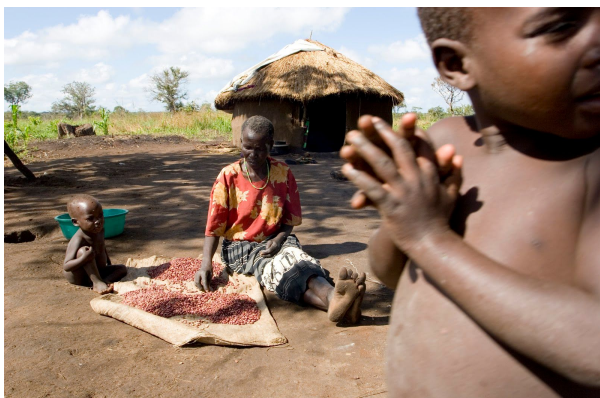
Building home grown solutions can improve seed systems resilience in fragile states

ISSD Africa is anchored on synergy, co-creation, joint experimentation, exchange and learning from ongoing activities. The overall approach is built around: leveraging context knowledge and seeking cost sharing benefits and economies of scope; pulling together existing knowledge and curating best practices; and emphasis on communication and sharing knowledge and results.